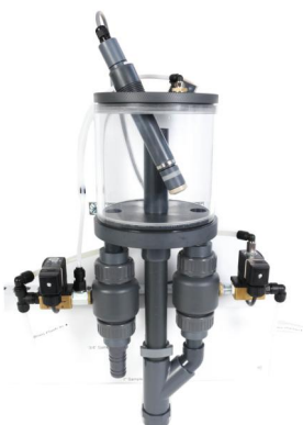
Autoflush Cell (OzoSense M) PN:36500001