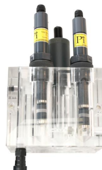
Triple Open Flow Cell (OzoSense M and e.g. chlorite and pH) PN:32100007