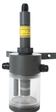
Single Closed Flow Cell (OzoSense M) PN:32100010