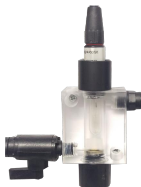
Single Closed Flow Cell (OzoSense NM) PN: 35003103