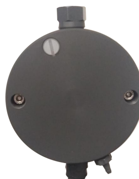
Flow Regulator (OzoSense NM) PN:37001304