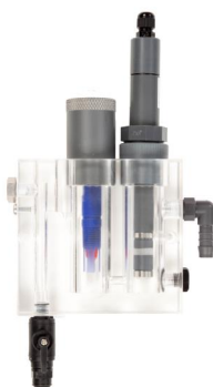
Double Open Flow Cell (OzoSense M and e.g. chlorite) PN:32100002