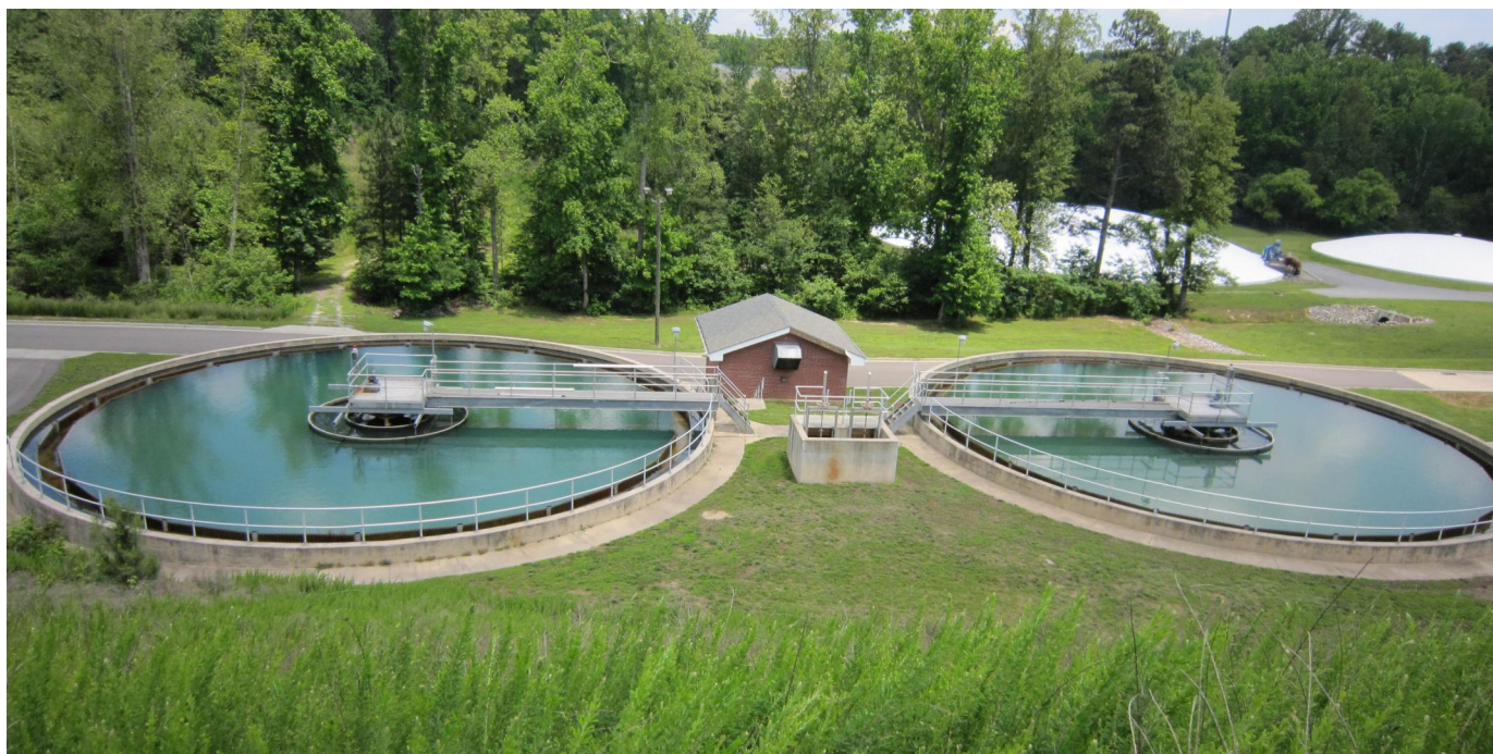
Water treatment site

Generally though, in a 'Flashy River' source Streaming Current technology does give reliable coagulation control.