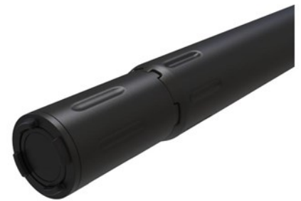
Fig. 1: Dissolved Oxygen Sensor - OxySense A

Early measurement of online DO in waste water was made by electrochemical cells that needed sacrificial electrodes, electrolyte, membranes and a lot of calibration. Whilst there are some companies still advocating the use of this technology it was largely replaced in the 1990s and 2000s with online optical measurement. The vast majority of online DO systems used today are optically based similar to the sensor shown in Figure 1.