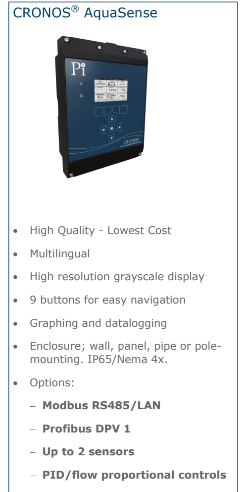
- Remote sensors

Each pool has a minimum turnover set by the manufacturer or consultant at the time of installation. The CRIUS<sup>®</sup>4.0 AquaSense allows the user to turn down the recirculating pump during periods of non pool use (overnight) to the minimum level. While the pool is being used, the recirculating pump motor is set based on chlorine demand which is proportional to bathing load. This ability to control the recirculating pump based on chlorine demand means that pool operators can save significant sums of money on electricity during the day when electricity costs the most.