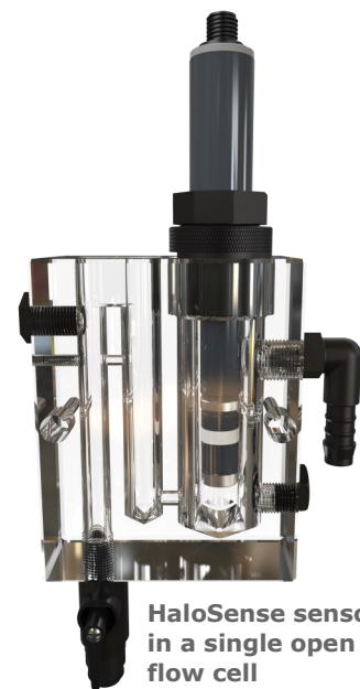
HaloSense sensor in a single open flow cell

The HaloSense sensor is a three electrode chrono amperometric potentiostatic sensor. The free chlorine molecules diffuse through the membrane and come into contact with the electrolyte. The electrolyte has a low pH which converts the majority of the OCl - to HOCl. All the HOCl is reduced at the gold cathode and the resultant ions travel through the electrolyte where they are oxidised at the silver/ silver chloride anode. The current flow is proportional to the concentration of free chlorine in the sample. The anode and cathode are held at the potential difference that provides an optimum catalytic reduction of HOCl.