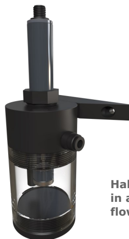
HaloSense sensor in a single closed flow cell