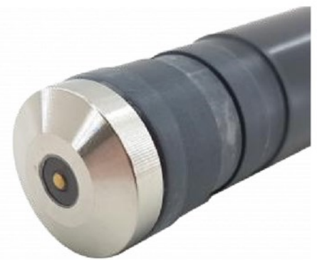
Peracetic Acid Sensor

PAA has been primarily used as a cleanser and disinfectant in the food industry since the 1950's, particularly for fruit and vegetable washing due to its highly effective anti-microbial properties. All disinfectants applied directly to food must not leave harmful residual by-products, which is why PAA is so widely used in this industry around the world. Other industries in which the water cleanliness is of paramount importance have also turned to PAA for disinfection including; agricultural, dairy processing, wineries, breweries and even cooling towers.