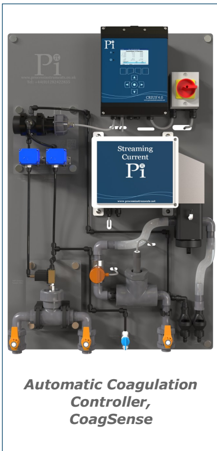
Automatic Coagulation Controller, CoagSense

Flow - available from existing plant flow meter