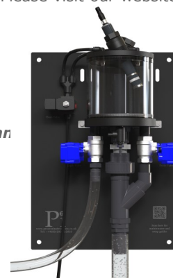
DioSense in an AutoFlush flow cell

The DioSense can be installed in a variety of auxiliary flow cells and self-cleaning devices. Please visit our website or refer to our ISB36 AutoFlush brochure.