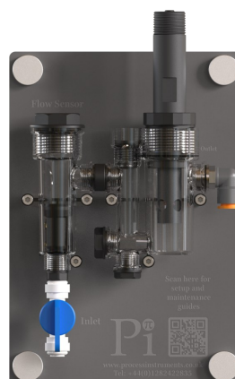
HaloSense sensor in a single flow cell