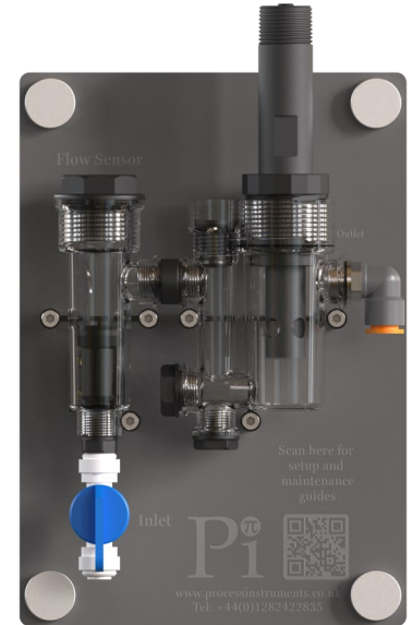
HaloSense sensor in a single flow cell

The HaloSense Free Chlorine sensor measures the concentration of dissolved free residual chlorine. In potable, process or swimming pool water this means HOCl (hypochlorous acid) plus OCl - (hypochlorite ion). The relative amount of these two species is dependent on the pH of the sample water. At low pHs (pH 6 and below) all the free chlorine will be HOCl. At higher pHs most of the free chlorine will be present as OCl - . Traditional amperometric measurement systems and some membraned sensors only measure the HOCl and need to be buffered to an exact pH in order that changes in the pH of the sample water do not affect the total Free Chlorine measurement. The probe supplied for Free Chlorine measurement with the HaloSense is not affected by changes in pH to the same degree. This means that on most plants (99.9%) it will not be necessary to buffer the sample water at all. On water supplies over about pH 8 it will only be necessary to correct for pH changes if the pH varies by a significant amount. The higher the pH the less it needs to vary to have a significant effect. If a plant does have high, variable pH it is possible to still use this sensor without acid buffering, however it will be necessary to use a pH sensor to compensate for varying pH. Please see Technical Note 02 pH Compensation for more information.