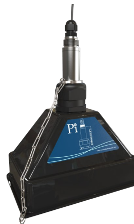
Optional light shield