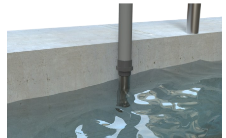
Dip-mounted SoliSense ®