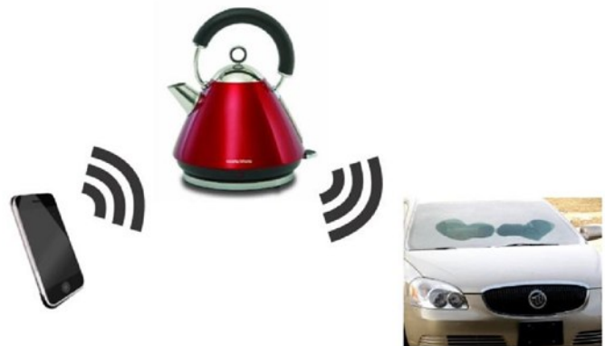
Internet of Things

And what does it matter? Well from Process Instruments' point of view, it doesn't. As long as our products are leading the way in providing our customers with what they need to enable their own Industry 4.0.