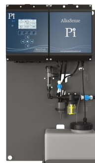
Mounted with controller