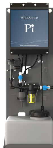
Model shown is an AlkaSense®